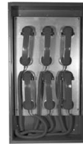
HAVED-TC (Shown with 6 HAVED-FH)