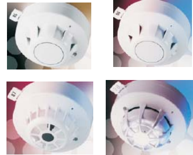
XP95 Series Sensors Heat, Ion, Photo, Multi

The Addressing of the detectors is accomplished by the removal of the associated binary X-perf card numbered pins or tabs totaling the address required. This unique, patented X-perf card holds the address in the base keeping it entirely free from electronic parts. This plastic card is inserted into the base keeping the address at the base if a detector is replaced, as in servicing requirements.